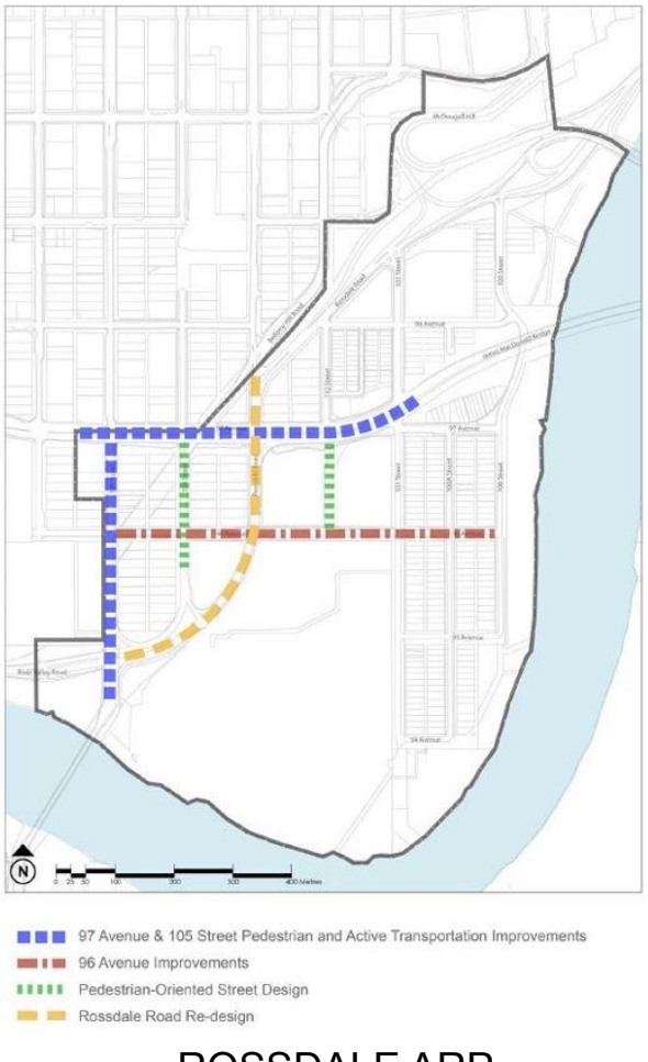
RIVER CROSSING BUSINESS PLAN