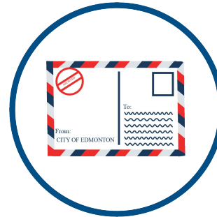
PUBLIC NOTICE March 30, 2023