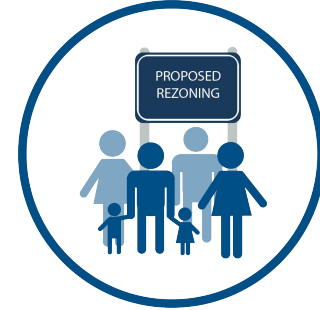
SITE SIGNAGE November 7, 2022