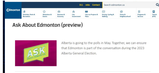
Web Page edmonton.ca/AskAboutEdmonton