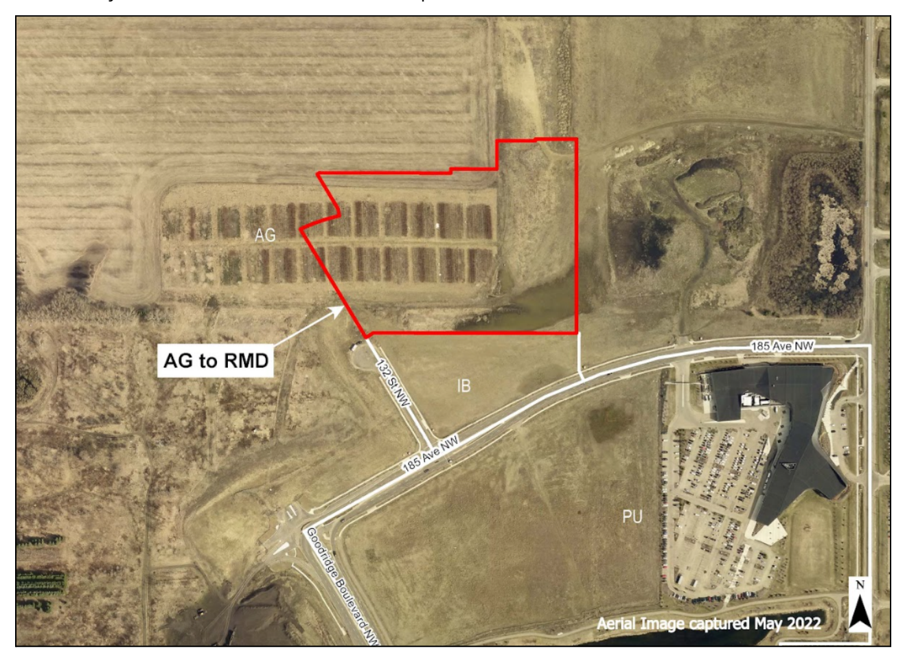
Aerial view of application area

Public Utility contains the Northwest Police Campus.