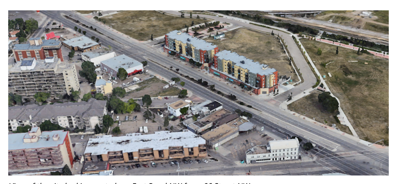
View of the site looking east along Fort Road NW from 66 Street NW.