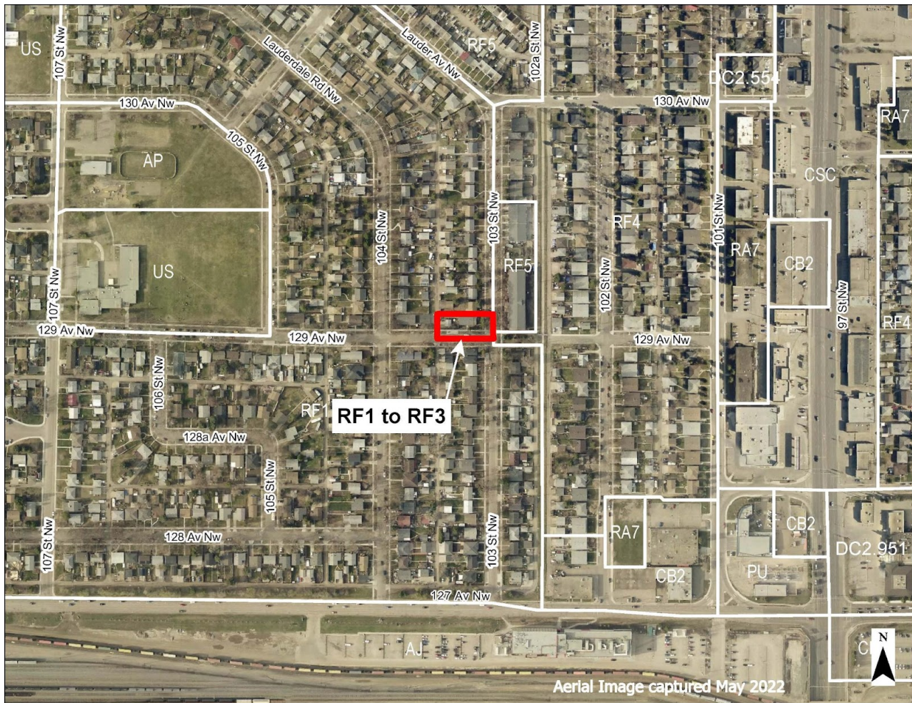
Aerial view of application area