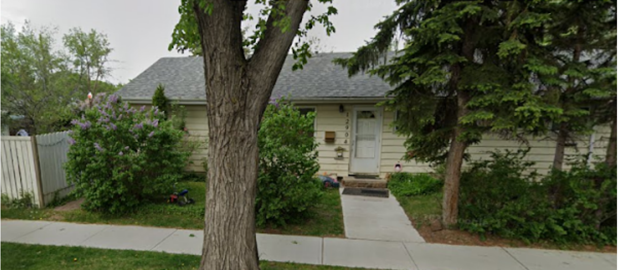
View of the existing house on the site looking north from 129 Avenue NW