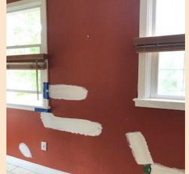
Damage to my walls