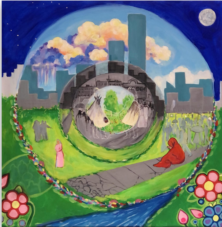
Title: pisiskapahtam Artist: Lana Whiskeyjack