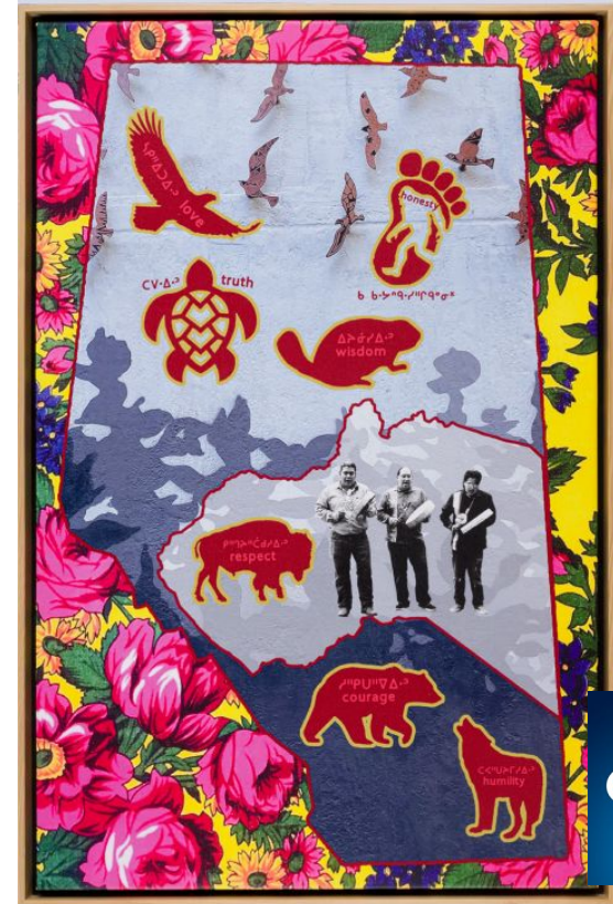
Title: Heart Beat of a Nation Artist: Brad Crowfoot