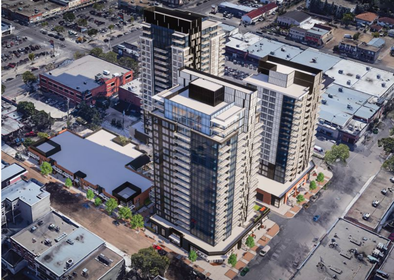
APPLICANT'S RENDERING SHOWN TO EDMONTON DESIGN COMMITTEE