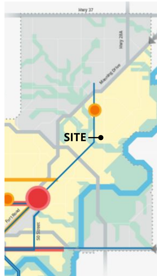
THE CITY PLAN