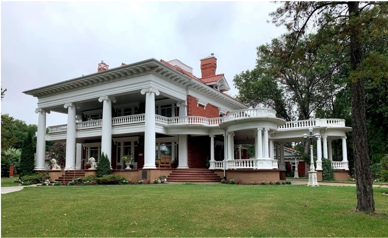
South and East Elevations