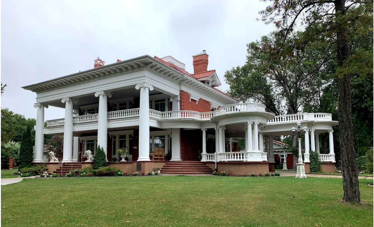
South and East Elevations