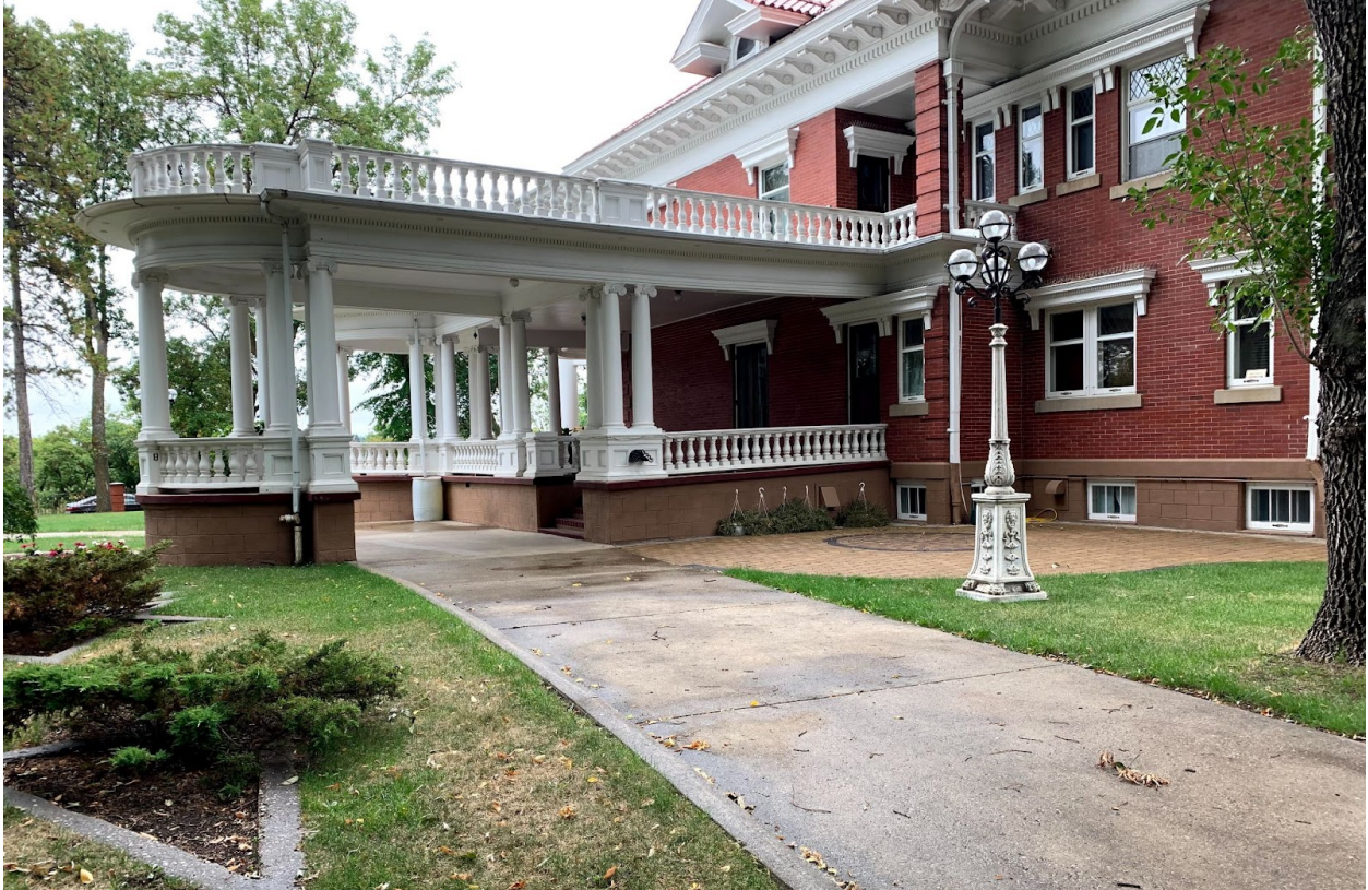
Entry Portico, East Elevation