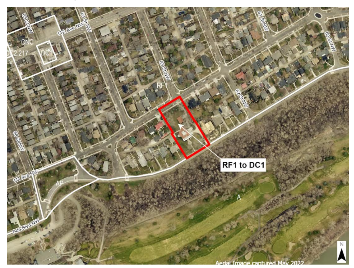
Aerial view of application area

The subject site is approximately 4,041 square meters in area, located on the southern edge of the Highlands neighbourhood. Vehicular access is through driveways accessed off Ada Boulevard and 111 Avenue. The property faces Ada Boulevard which travels west to east across the entire neighbourhood and is a pedestrian and bike corridor. 111 Avenue abuts the north of the property and is a local road that is undergoing upgrades under the Building Great Neighbourhoods program. Transit can be accessed approximately 200 m to the north along 112 Avenue. To the south of the property is the river valley and Highlands Golf Course. The surrounding area is developed with single detached housing, many of which are on the Inventory of Historic Resources.