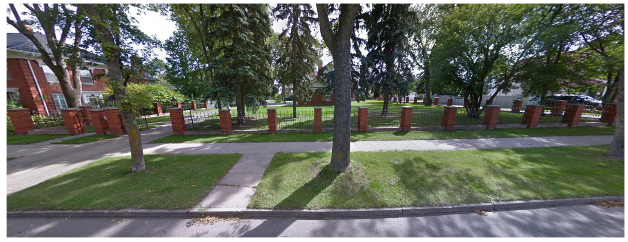
View of the site looking south from 111 Avenue NW