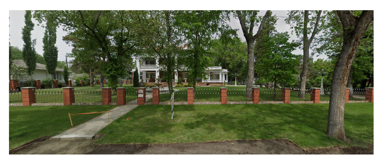
View of the site looking north from Ada Boulevard NW