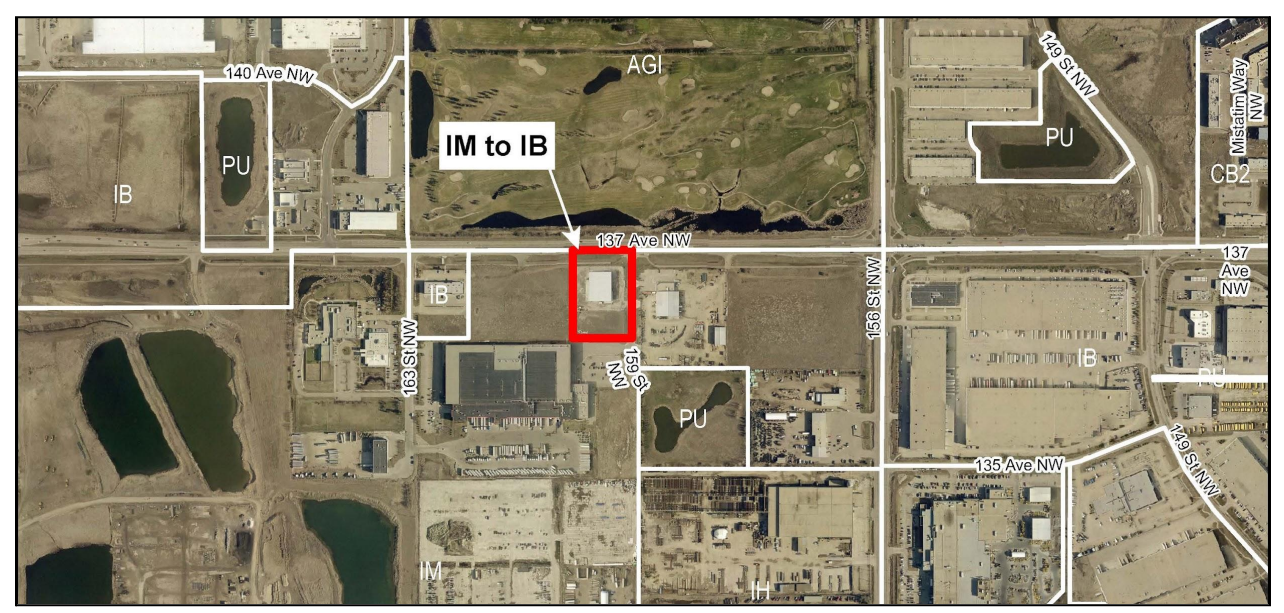
Aerial view of application area