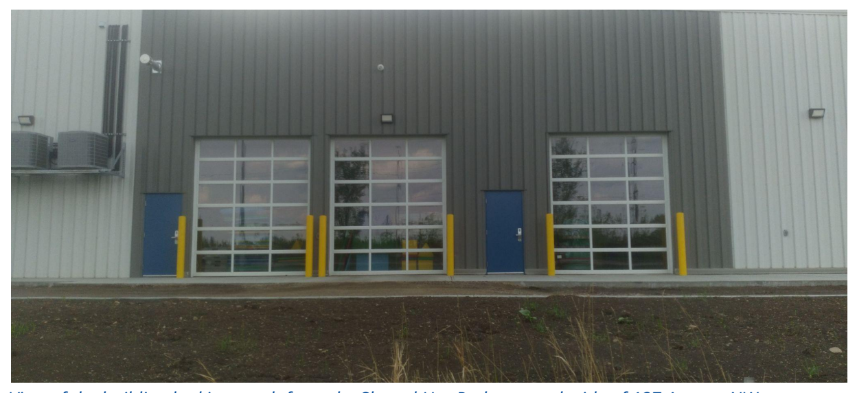
View of the building looking south from the Shared Use Path on south side of 137 Avenue NW