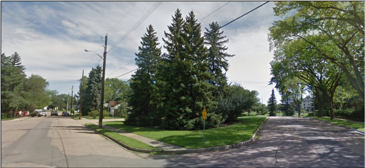
View of the site looking northeast from the intersection of 107 St and 60 Avenue