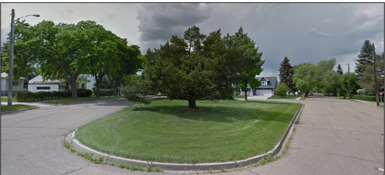
View of the site looking southwest from 60 Avenue