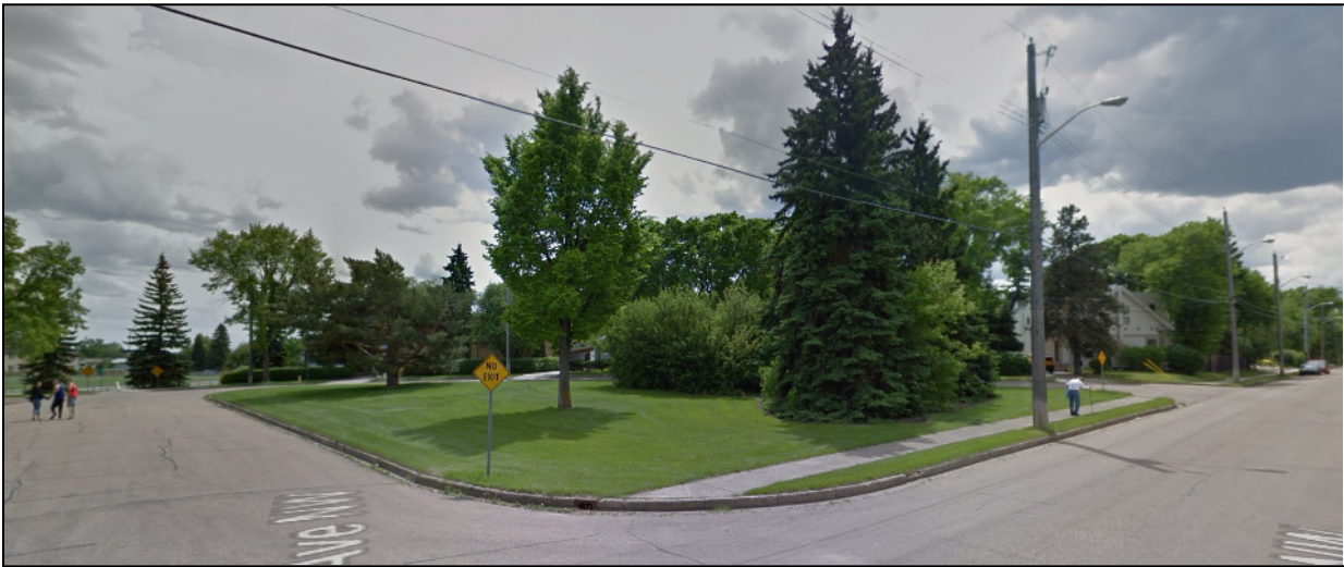
View of the site looking southeast from the intersection of 107 Street and 60 Avenue