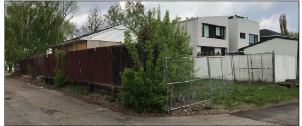
View of the site looking northwest for the intersection of the rear and flanking lane