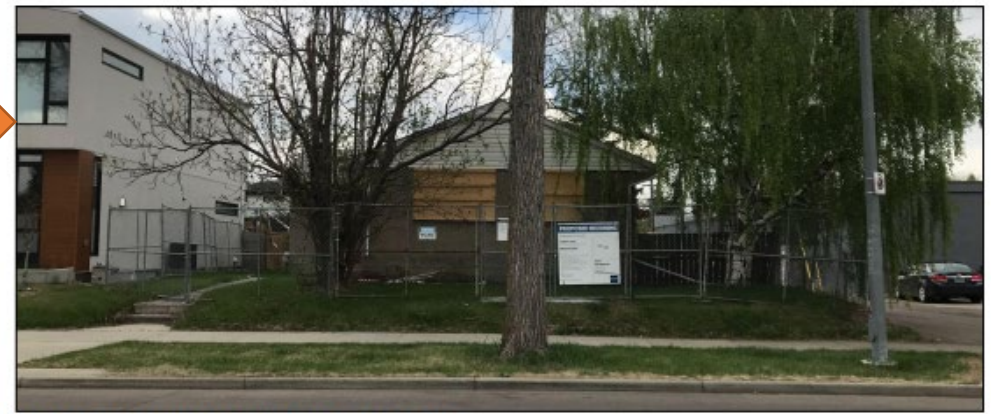
View of the site looking east from 143 Street NW