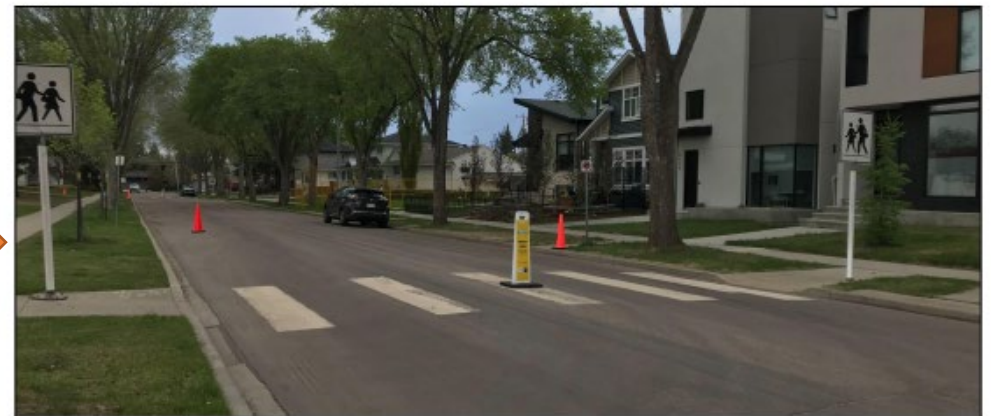
View of the crosswalk (east-west) across 143 Street NW. The crosswalk aligns with the subject site's northern property line.