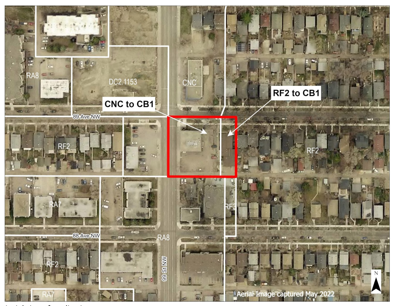
Aerial view of application area

The site is just under 2000 square metres in size and located at a corner site along 99 Street NW, an arterial road with bus service and both northbound and southbound stops just across the street/avenue from the site.