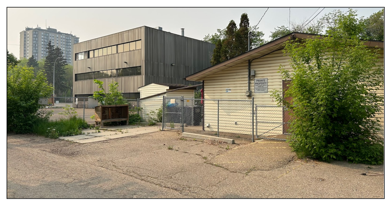
View of the site looking northwest from the rear lane