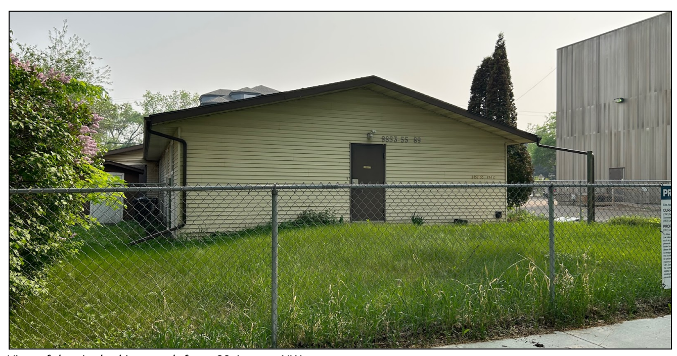
View of the site looking south from 89 Avenue NW