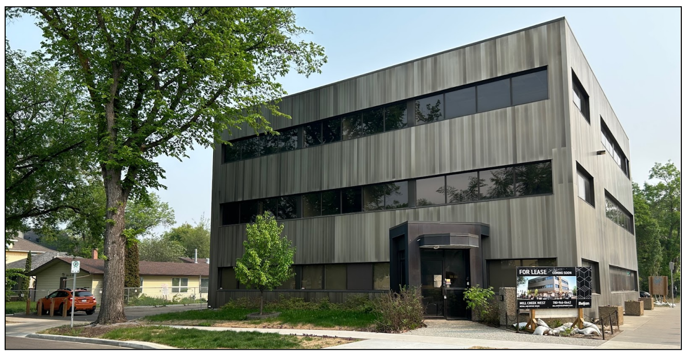
View of the site looking southeast from 89 Avenue NW and 99 Street NW