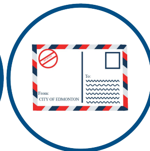
PUBLIC HEARING NOTICE June 15, 2023