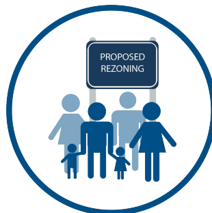
SITE SIGNAGE April 27, 2023