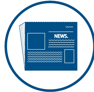
JOURNAL AD June 23, 2023 & June, 2023