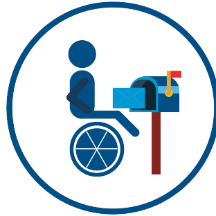
NOTICE OF PROPOSAL November 9, 2022

In support of the closure and rezoning to preserve natural area and add more park space