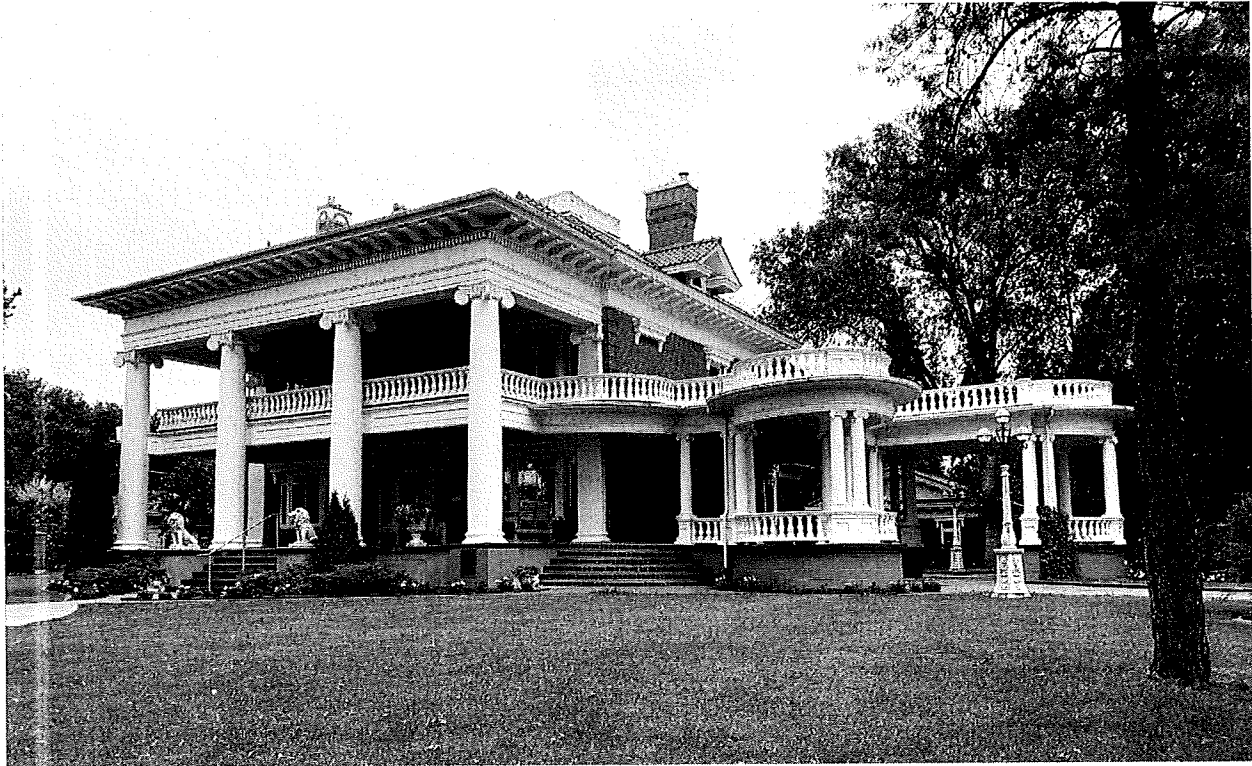
South and East Elevations