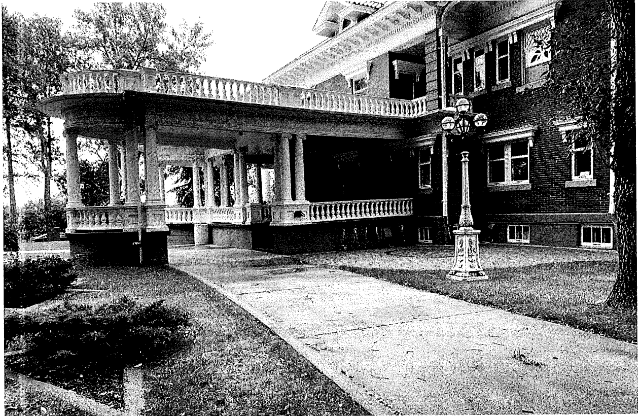
Entry Portico, East Elevation