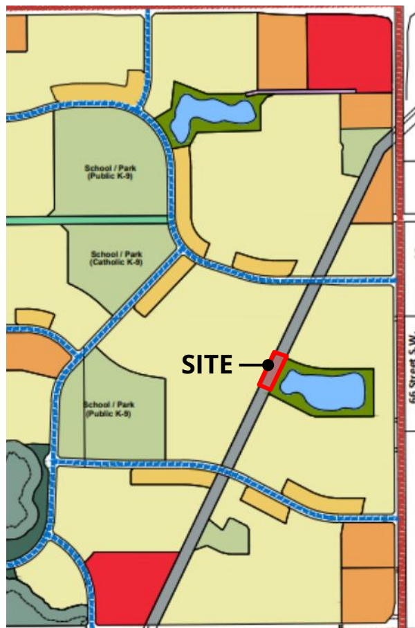
THE ORCHARDS AT ELLERSLIE NSP