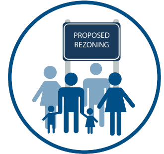
SITE SIGNAGE Nov 22, 2022