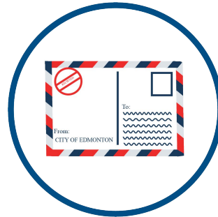
PUBLIC HEARING NOTICE Jul 27, 2023