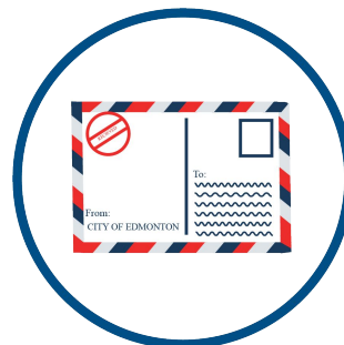
PUBLIC HEARING NOTICE Aug 17, 2023