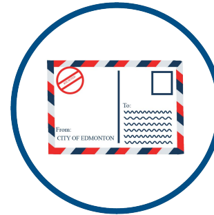
PUBLIC HEARING NOTICE Aug. 25 & Sept. 2, 2023