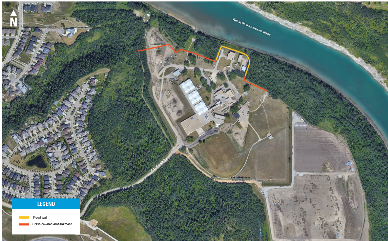
Proposed flood barriers at the E.L. Smith WTP.

Note, in general, these barriers are approx. 2 metres in height. Near the Low Lift Pump Houses, where the ground falls away, the barrier appears taller.