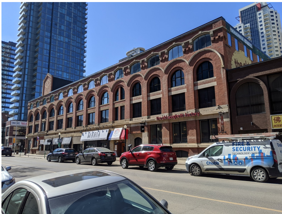
View of east elevation, looking southwest from 103 Street NW.