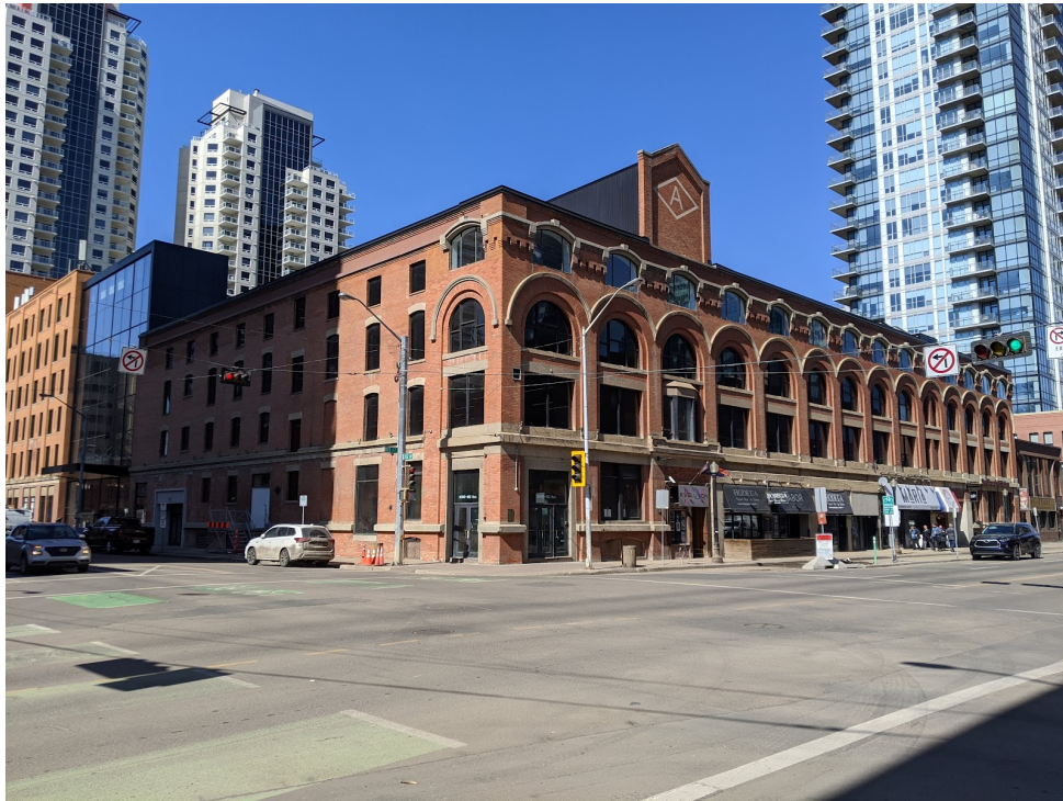
View of east and south elevations, looking northwest from 102 Avenue NW.