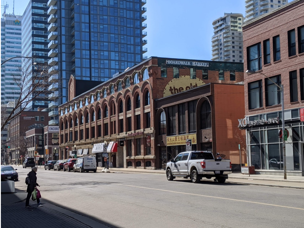
View of portion of north elevation and east elevation, looking southwest from 103 Street NW.