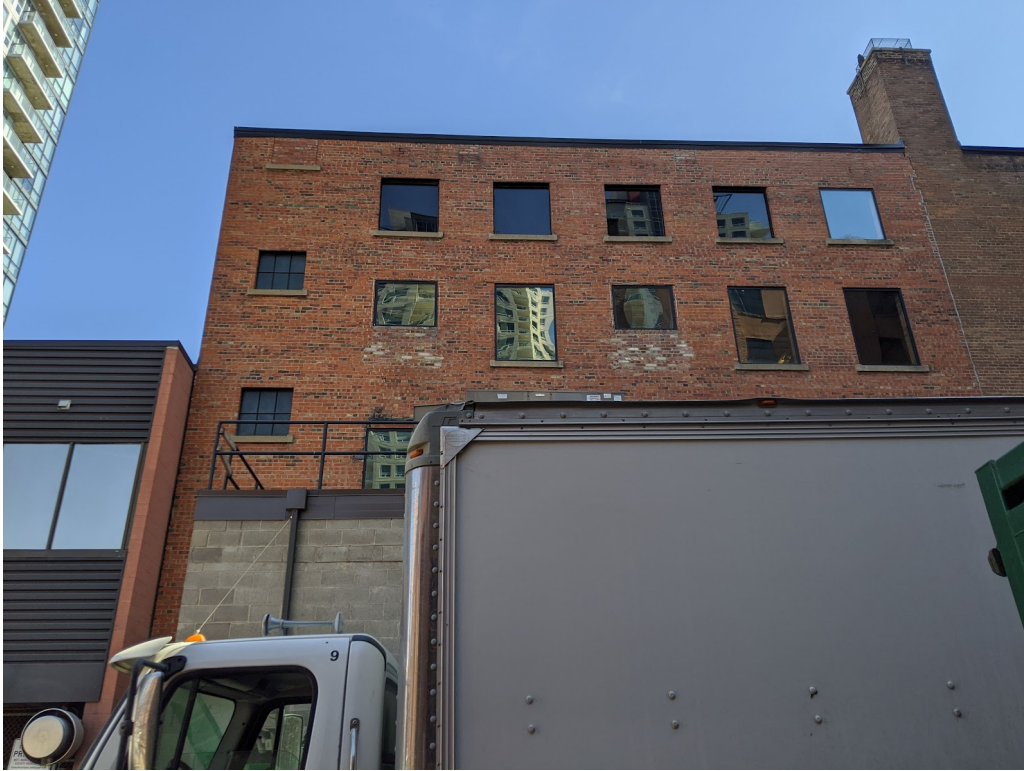
View of west elevation, looking east from back alley.