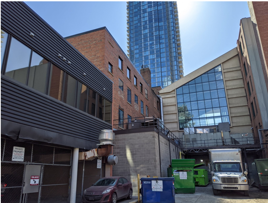
View of west elevation, looking south from back alley. Note the atrium extension at right of image that connects the building to the Revillon Building.