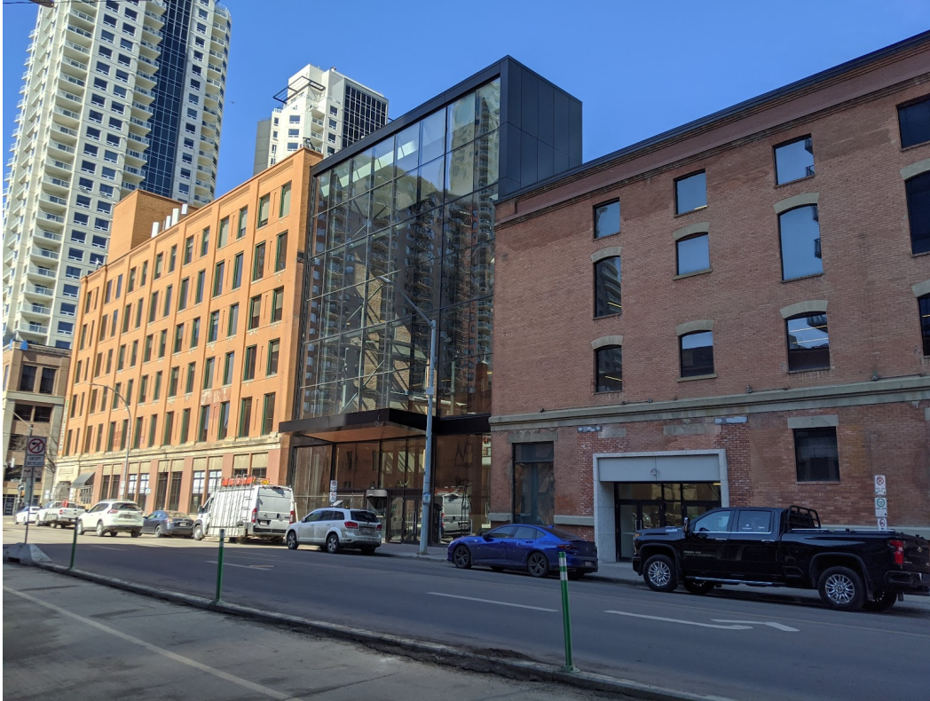
Context image showing the Revillon Building (at left) with recently-renovated atrium connection to The Boardwalk Building (at right).