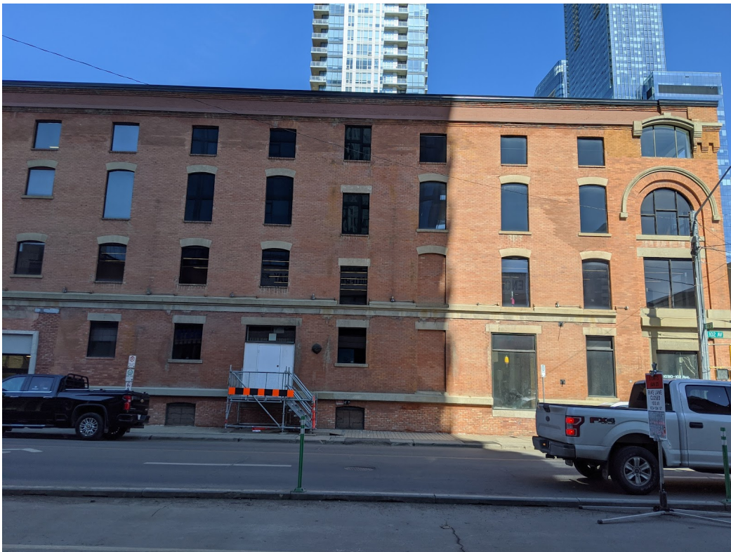
View of south elevation, looking north from 102 Avenue NW.