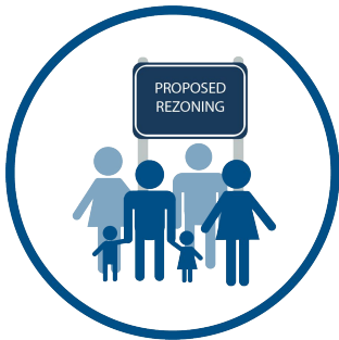
SITE SIGNAGE July 25, 2023