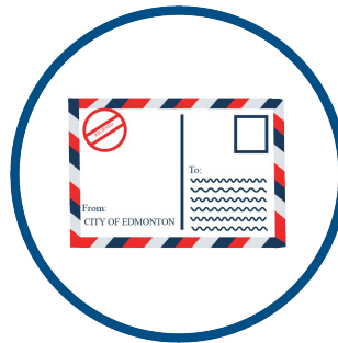
PUBLIC HEARING NOTICE Sept. 7, 2023