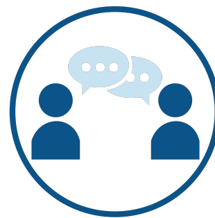
1:1 COMMUNICATIONS July 5 - Sept. 29, 2023