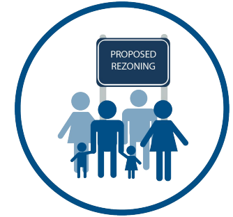
SITE SIGNAGE July 14, 2023