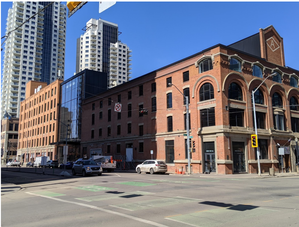
Context image showing the Revillon Building (at left) with recently-renovated atrium connection to The Boardwalk Building (at right).