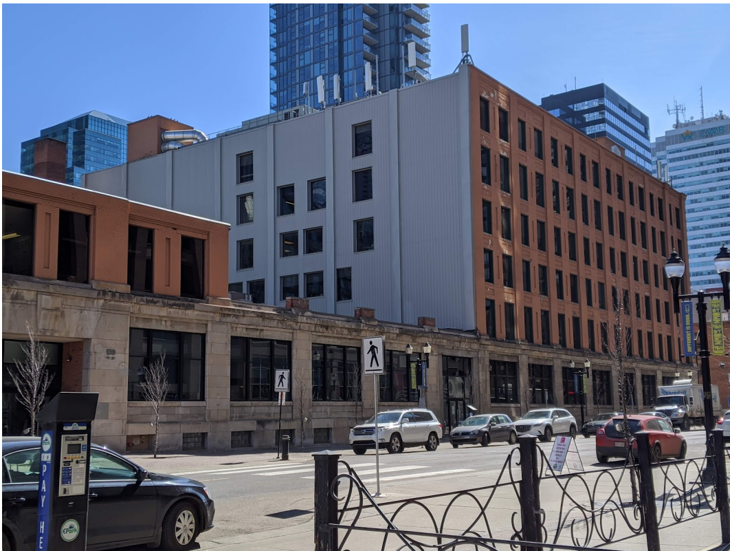
View of north elevation, looking southeast from 104 Street.