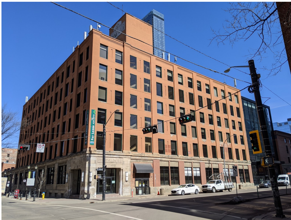
View of south and west elevations, looking northeast from 102 Avenue NW.