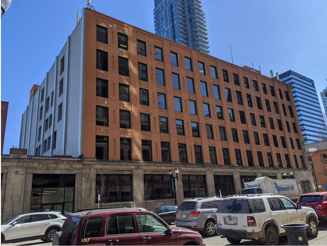
View of west and north elevations, looking southeast from 104 Street NW.