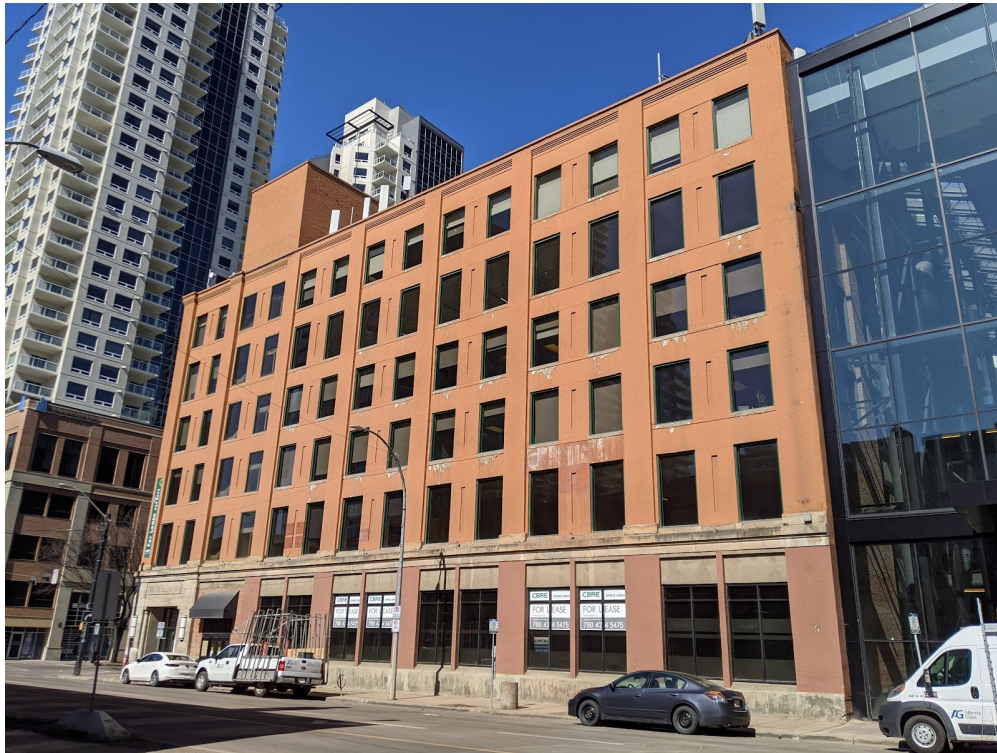
View of south elevation, looking northwest from 102 Avenue NW.