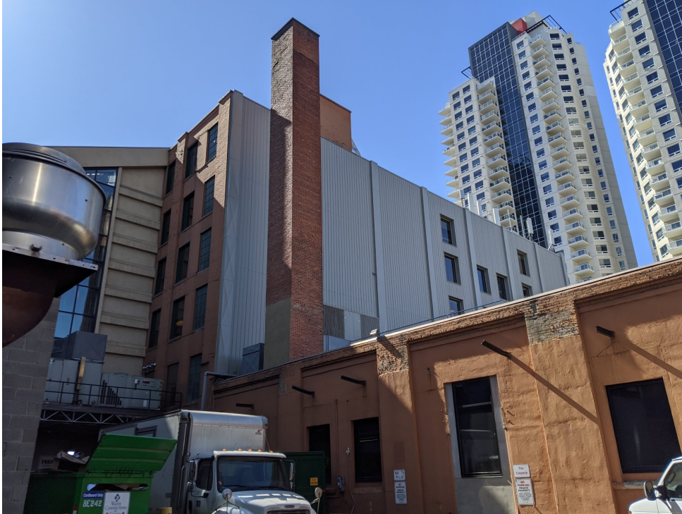
View of north elevation and portion of east elevation, looking southwest from back alley. Note portion of the atrium extension at left of image that connects the building to The Boardwalk.