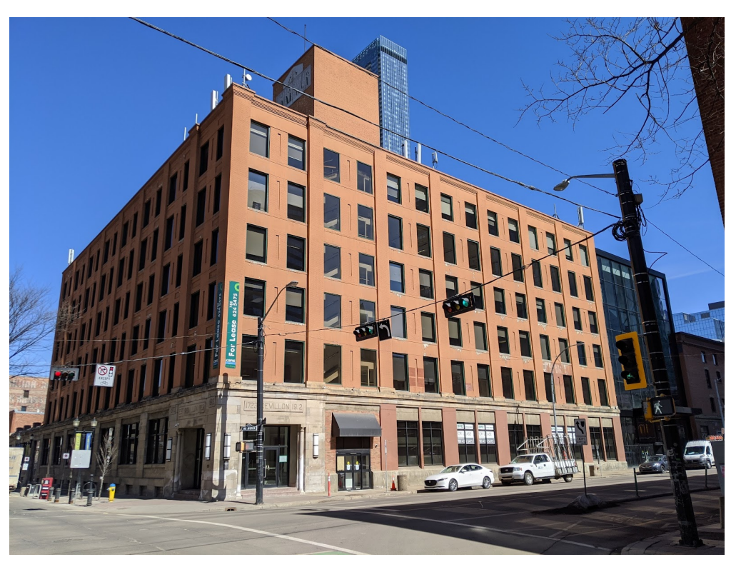
View of south and west elevations, looking northeast from 102 Avenue NW.