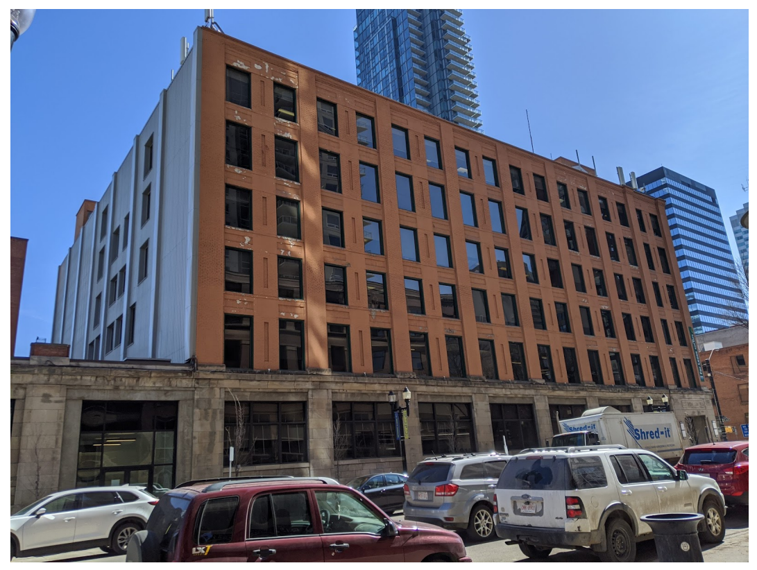
View of west and north elevations, looking southeast from 104 Street NW.