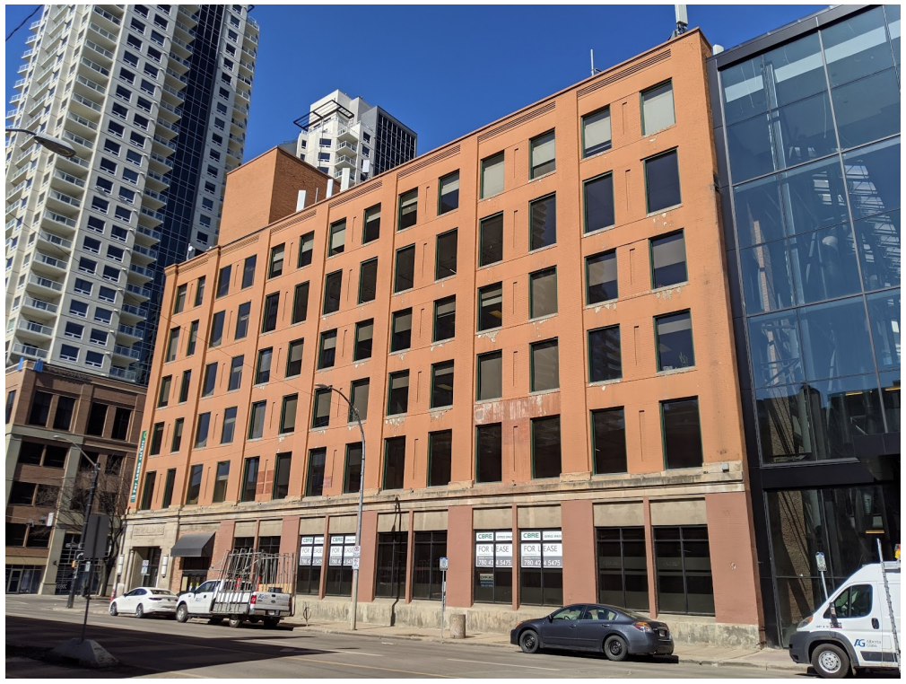
View of south elevation, looking northwest from 102 Avenue NW.