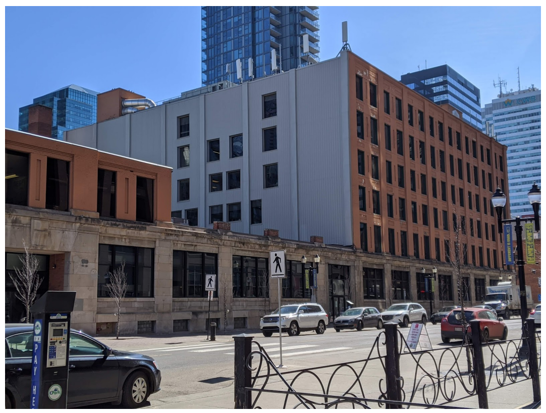
View of north elevation, looking southeast from 104 Street.