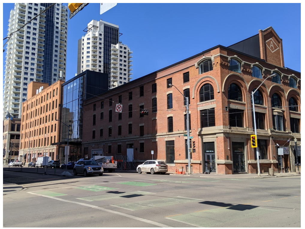
Context image showing the Revillon Building (at left) with recently-renovated atrium connection to The Boardwalk Building (at right).