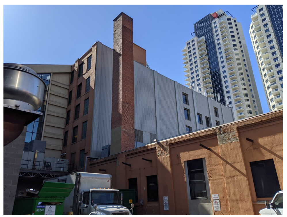
View of north elevation and portion of east elevation, looking southwest from back alley. Note portion of the atrium extension at left of image that connects the building to The Boardwalk.