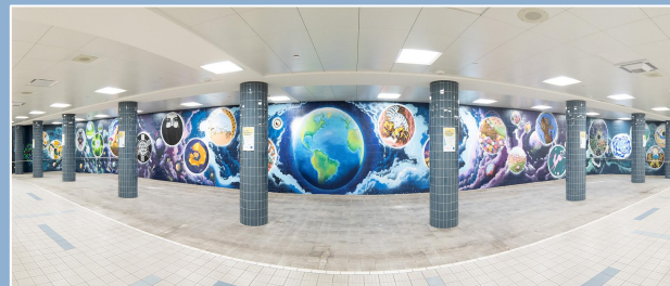
Examples of ETS Space Activations