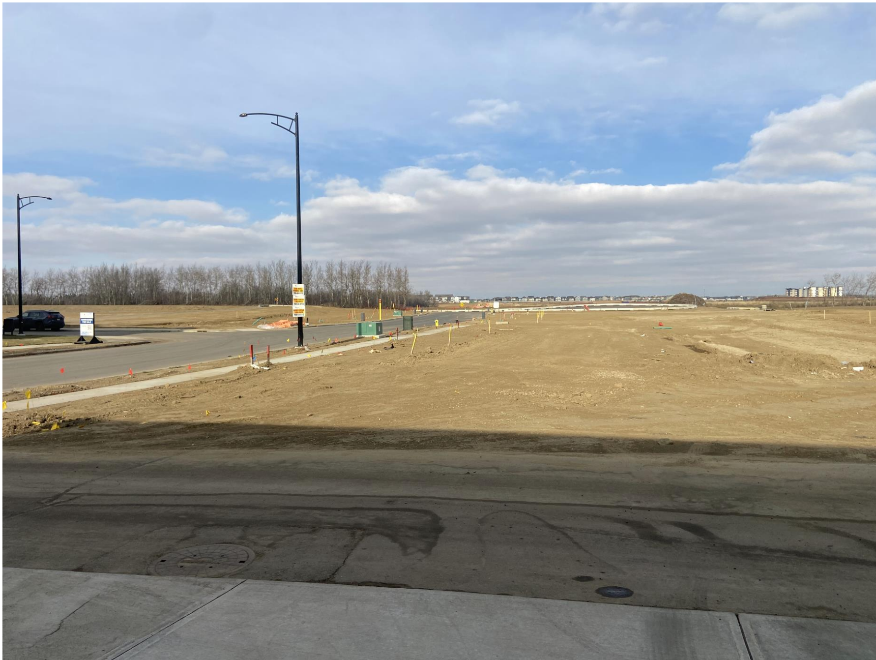
View of the site north of my garage