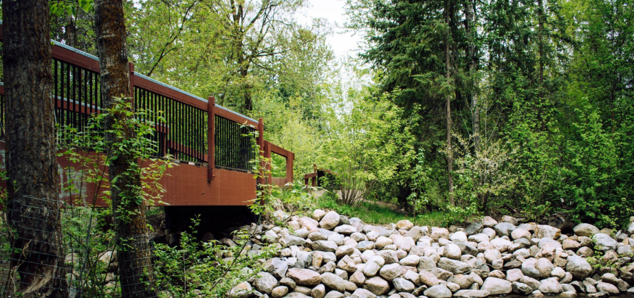
Mill Creek Ravine