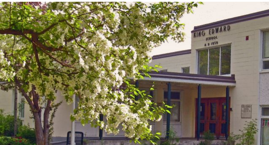
King Edward School