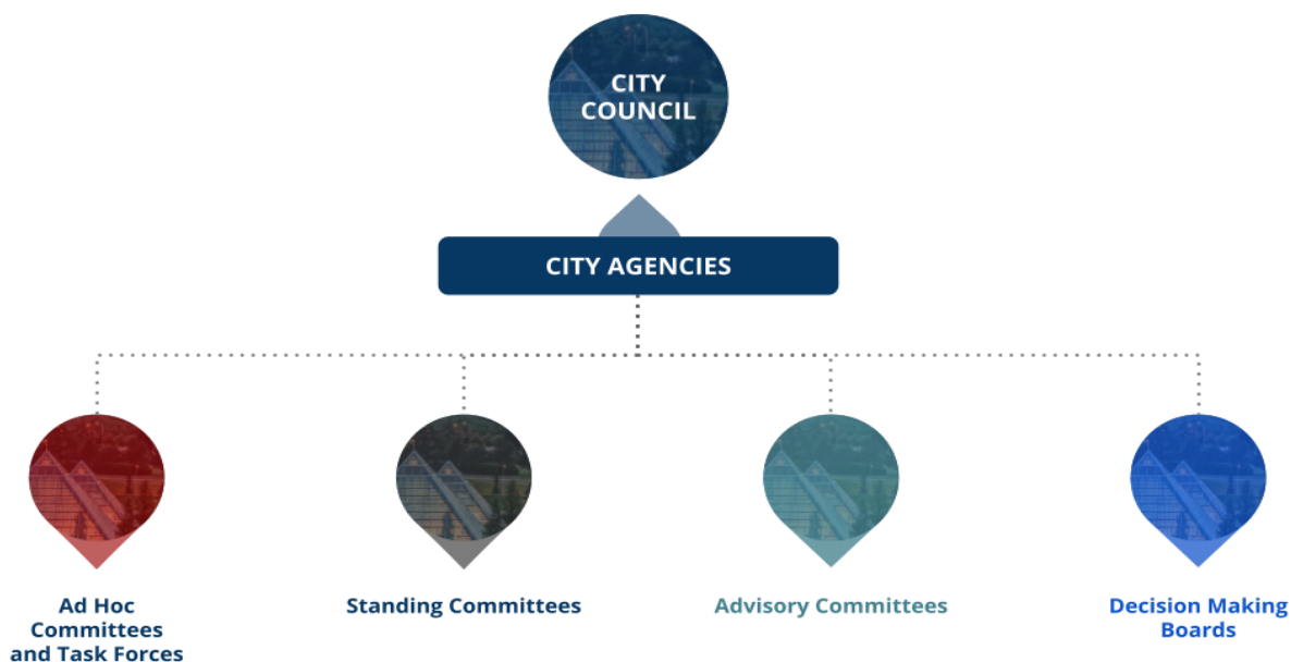
Image 1 - Extended Governance Model

Advisory Committees, are established and accountable to City Council and are governed by: