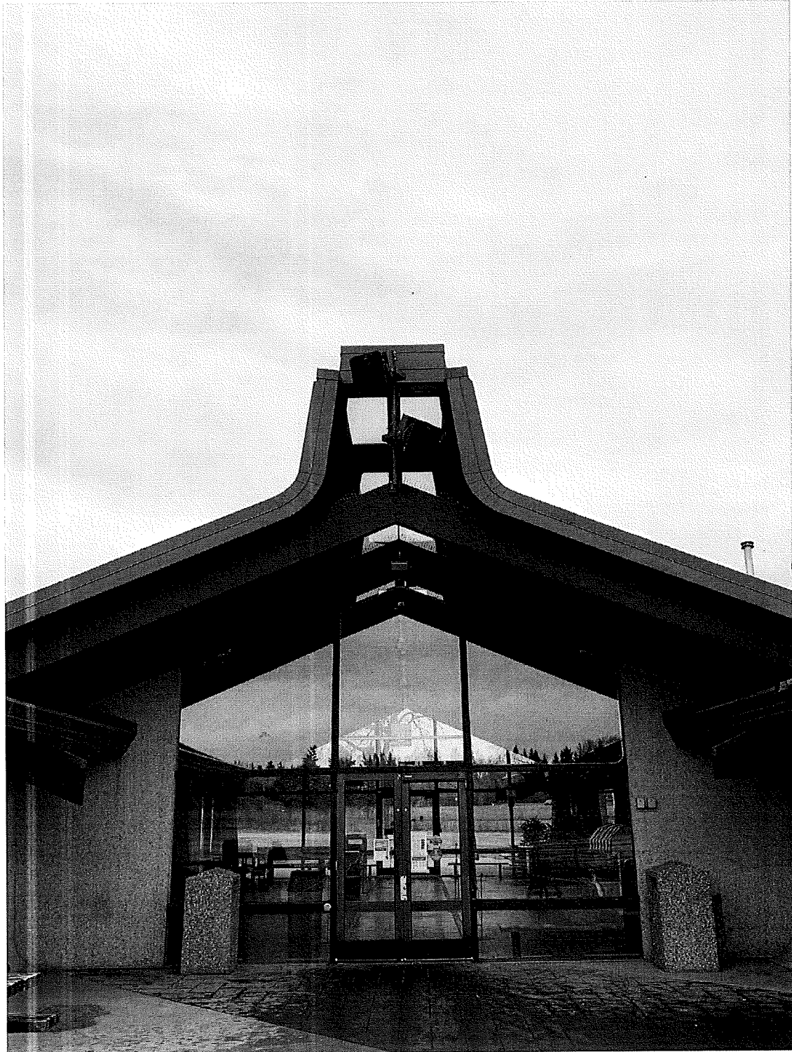
Main Pavilion, main entrance