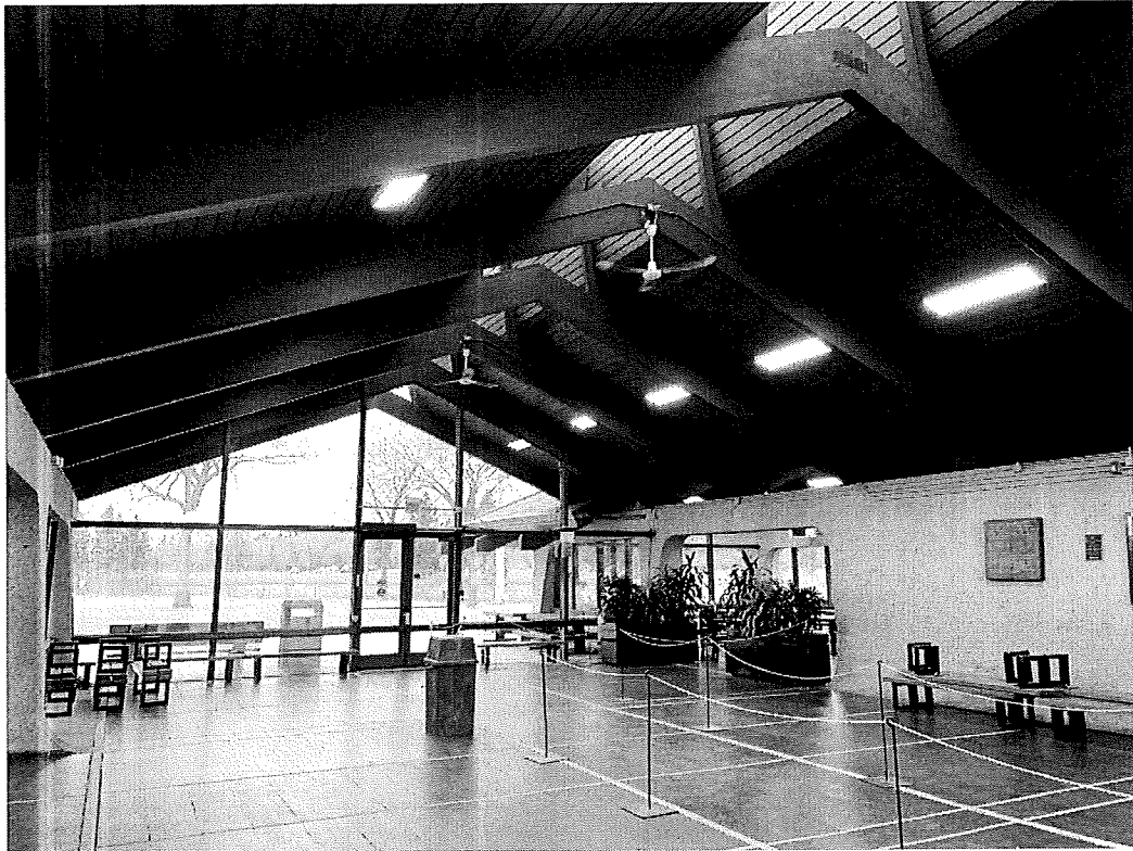
Main Pavilion interior, looking south towards south entrance