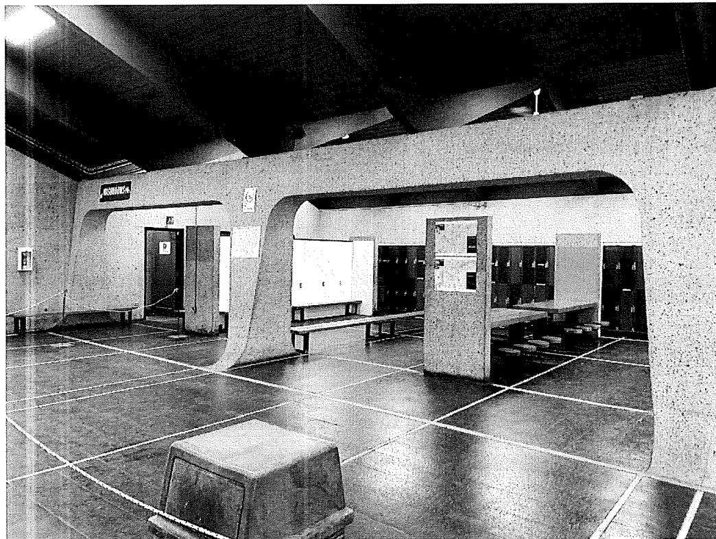
Main Pavilion interior, showing locker and seating areas