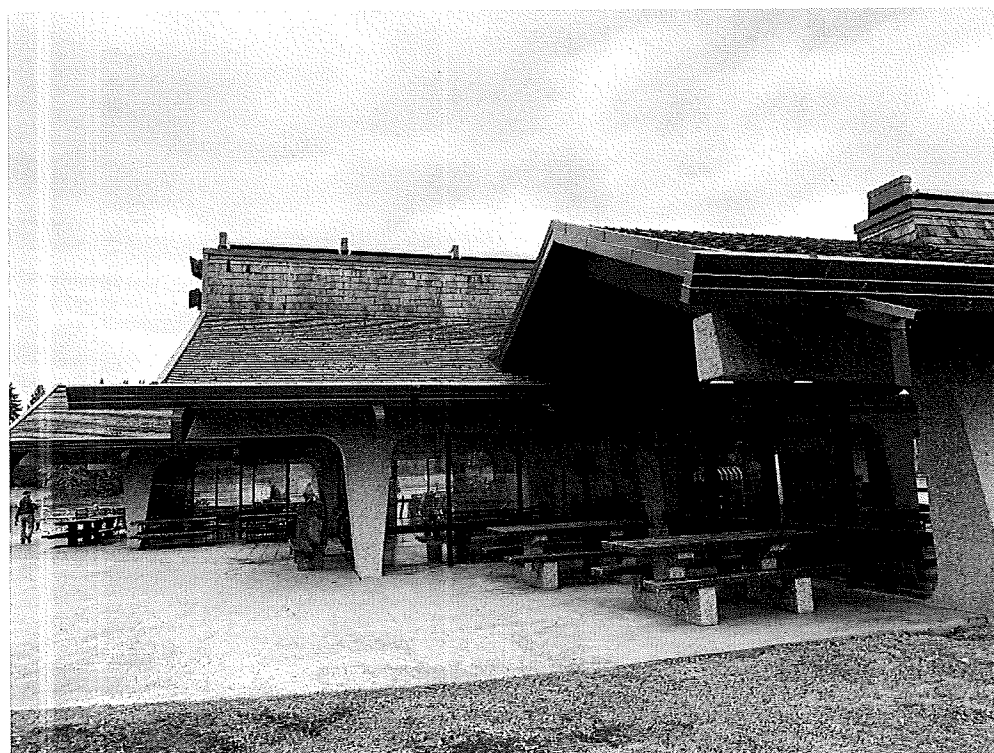
Main Pavilion south entrance, looking west