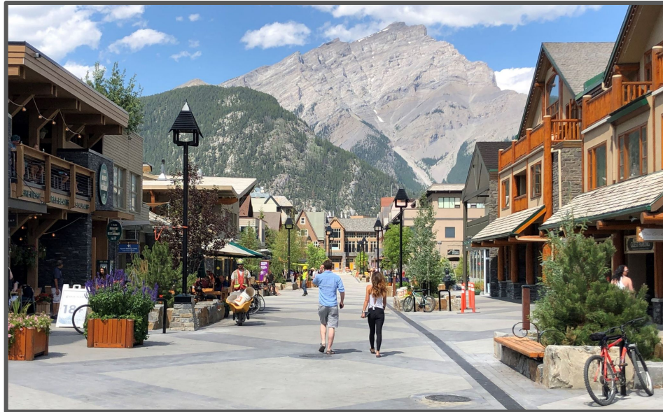
Bear Street, Banff - 2021