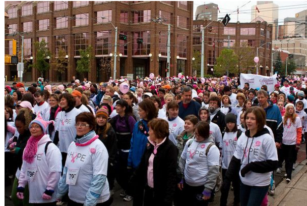
Temporary : Downtown Edmonton Event