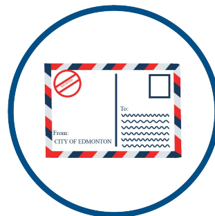
PUBLIC HEARING NOTICE Nov 16, 2023