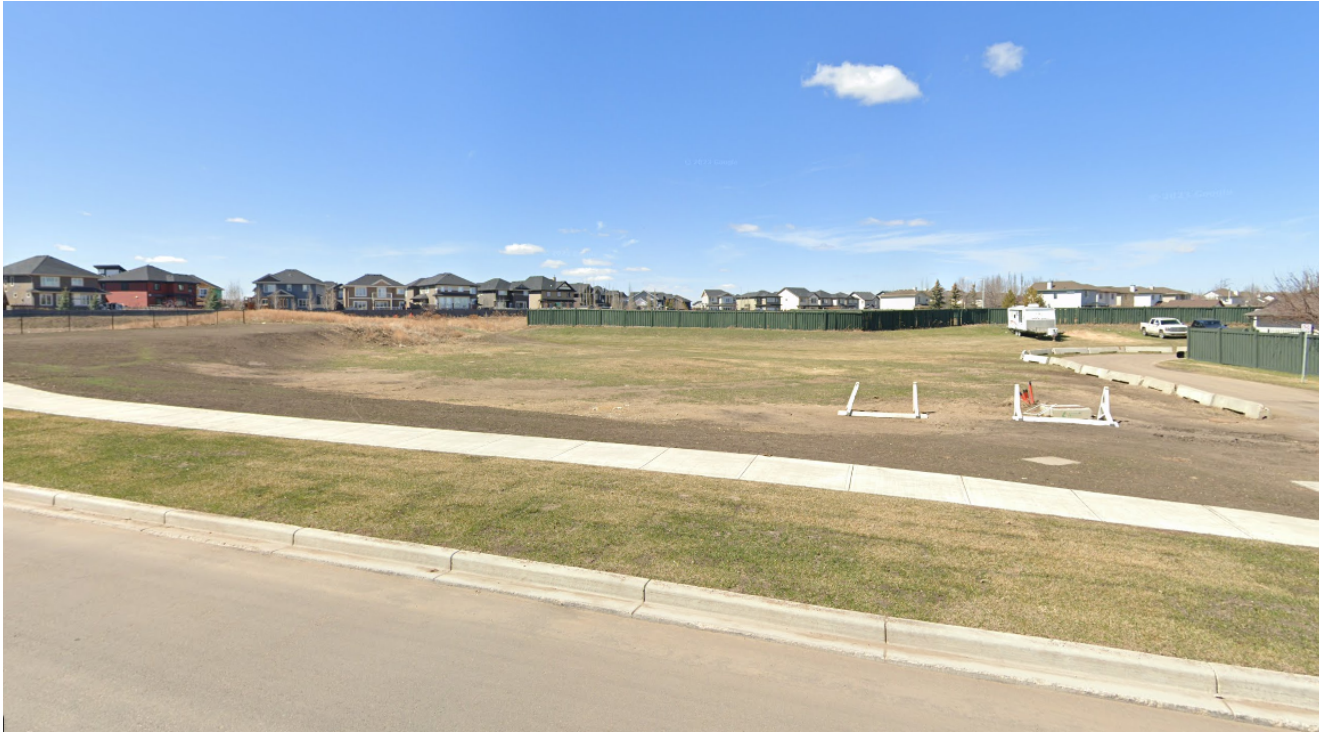
Street view of the site looking northwest from Grantham Drive NW