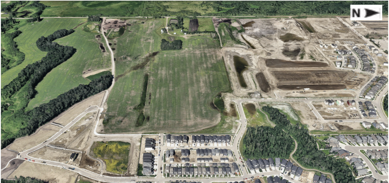
Aerial view of site looking towards the west