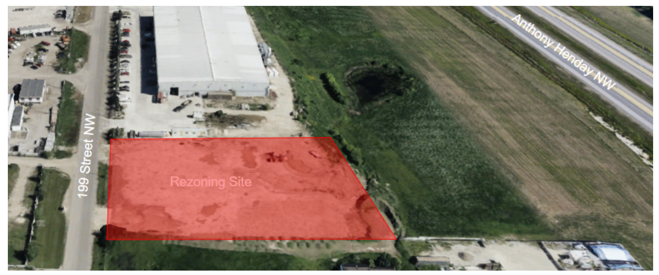
View of Site looking north