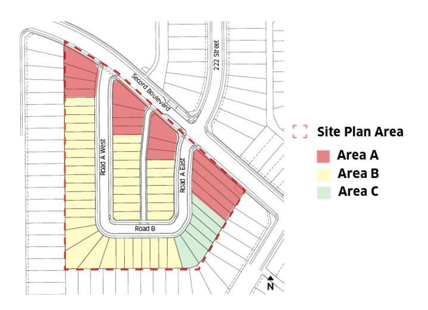
Appendix A - Conceptual Site Plan