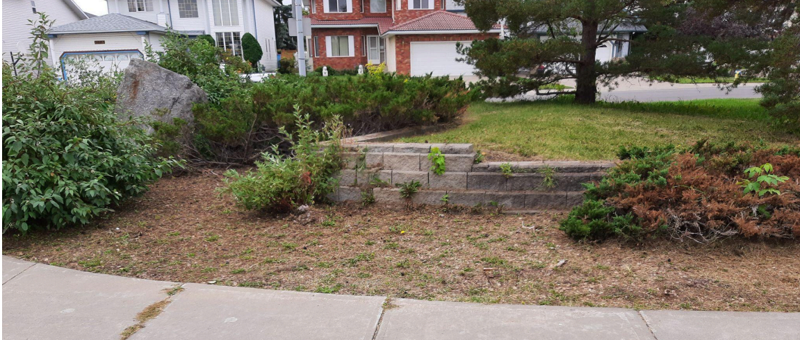
Figure 2: Horticulture bed maintained with reduced weed removal quality