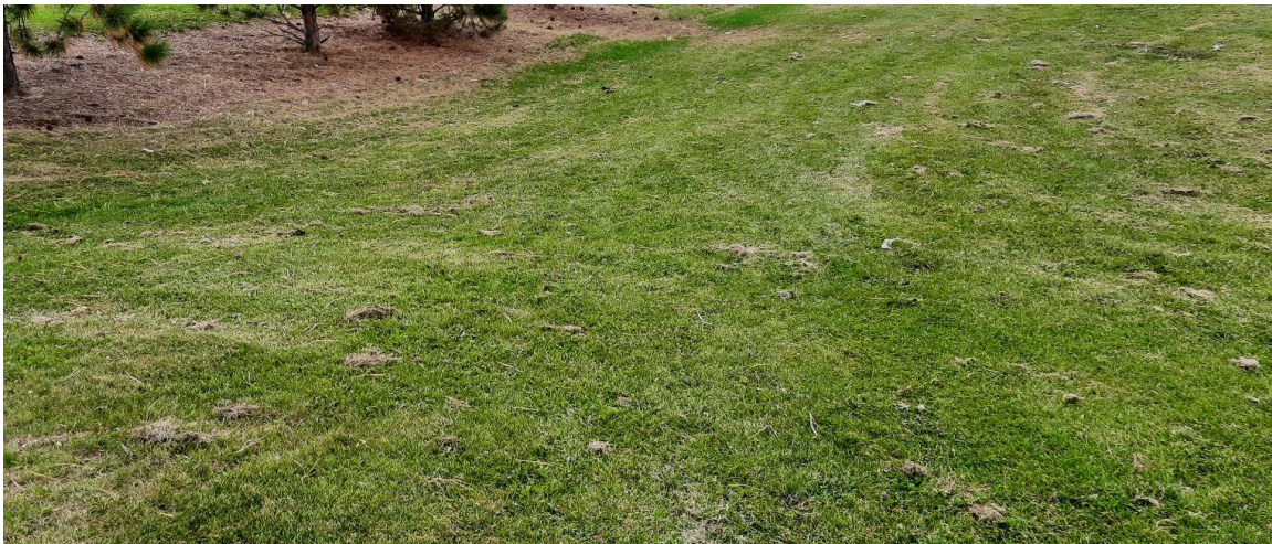
Figure 3: Turf field that is mowed at the current 10-14 day targeted service level, leaving clumps of long grass behind