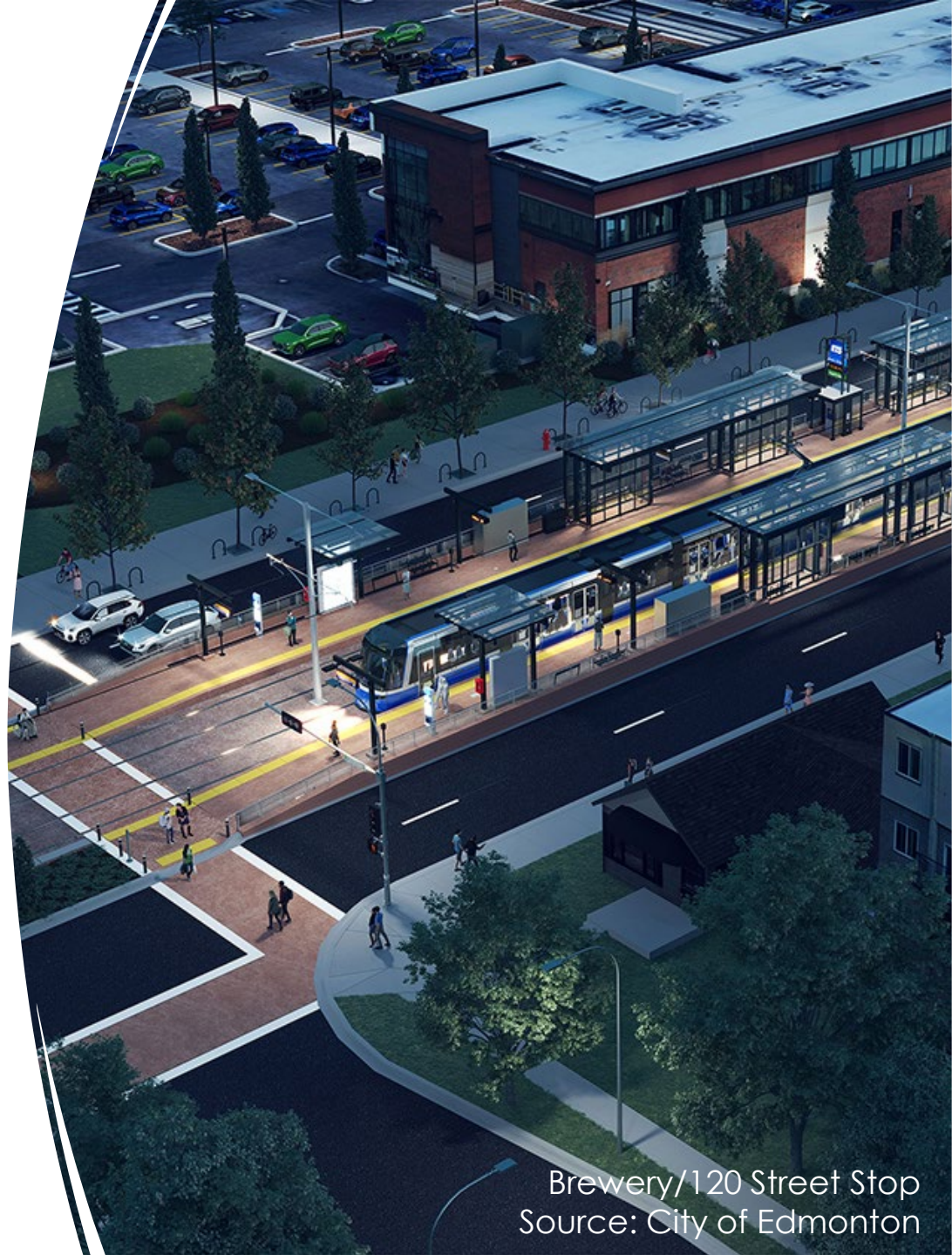
Brewery/120 Street Stop