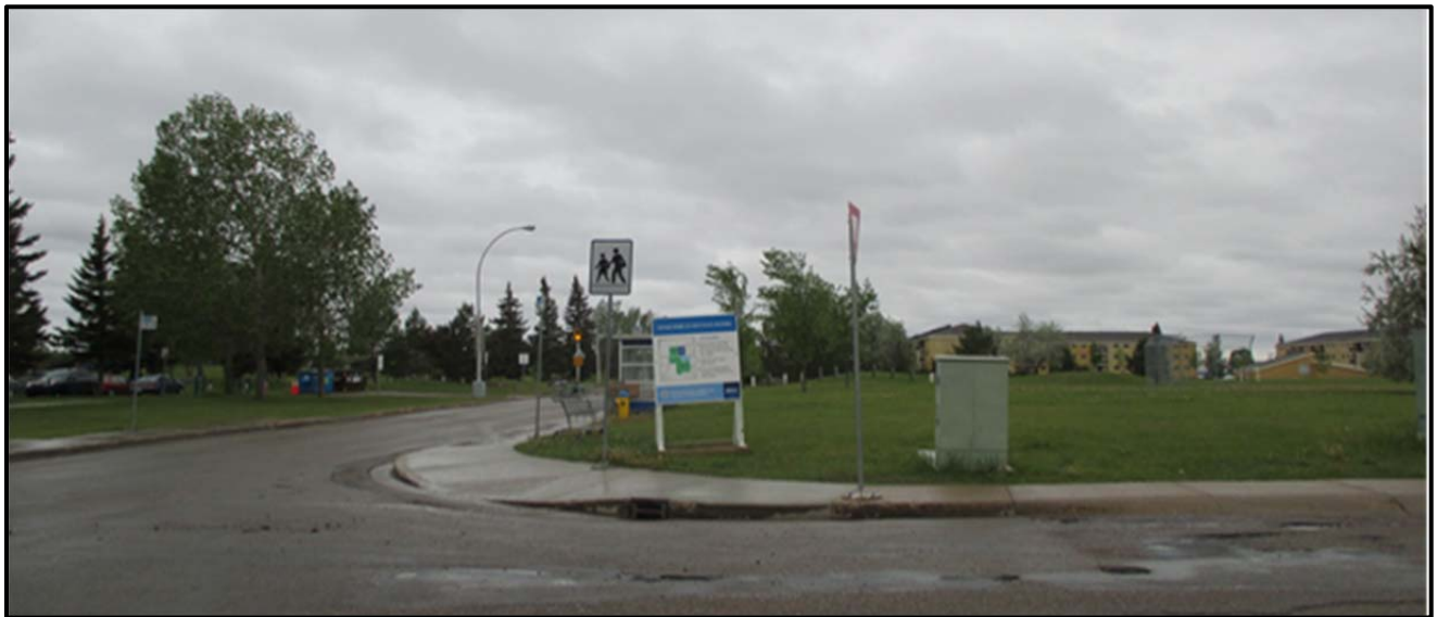
VIEW OF SITE LOOKING WEST ALONG 134 AVENUE NW, FROM 43 STREET NW