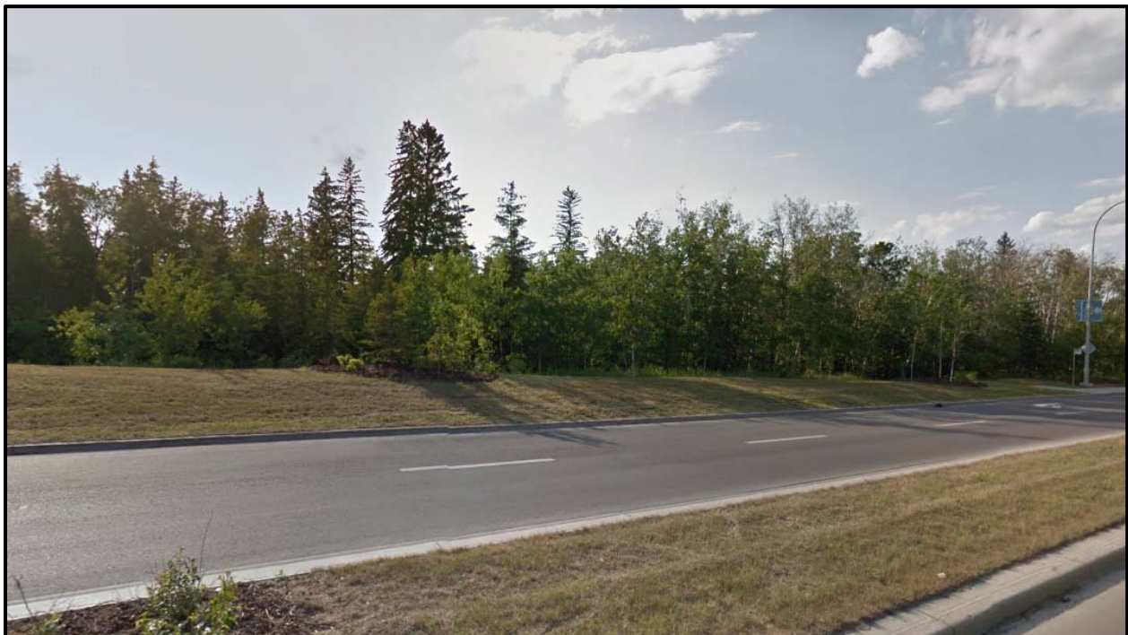
VIEW LOOKING NORTHEAST FROM 141 STREET SW