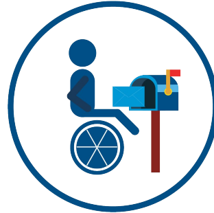
MAILED NOTICE Jan 23, 2023