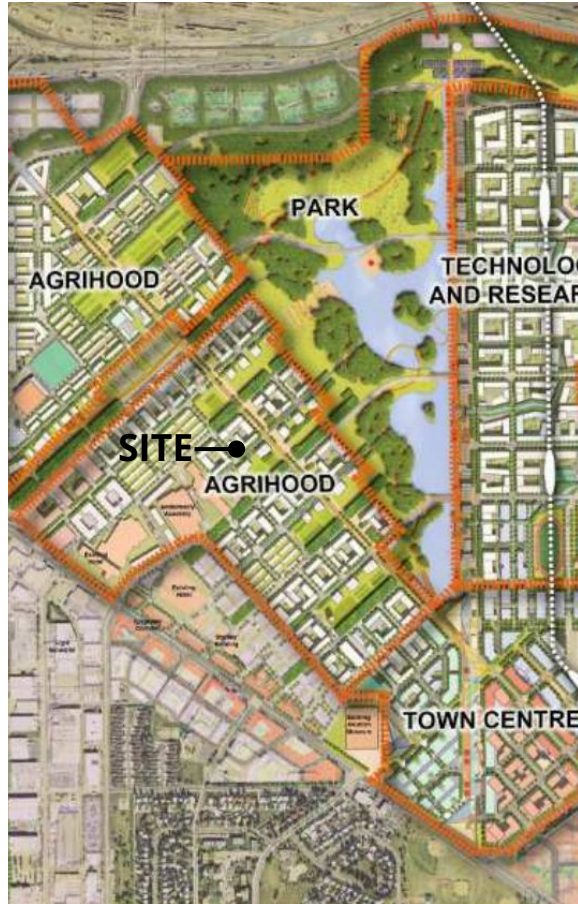
CENTRE CITY ARP