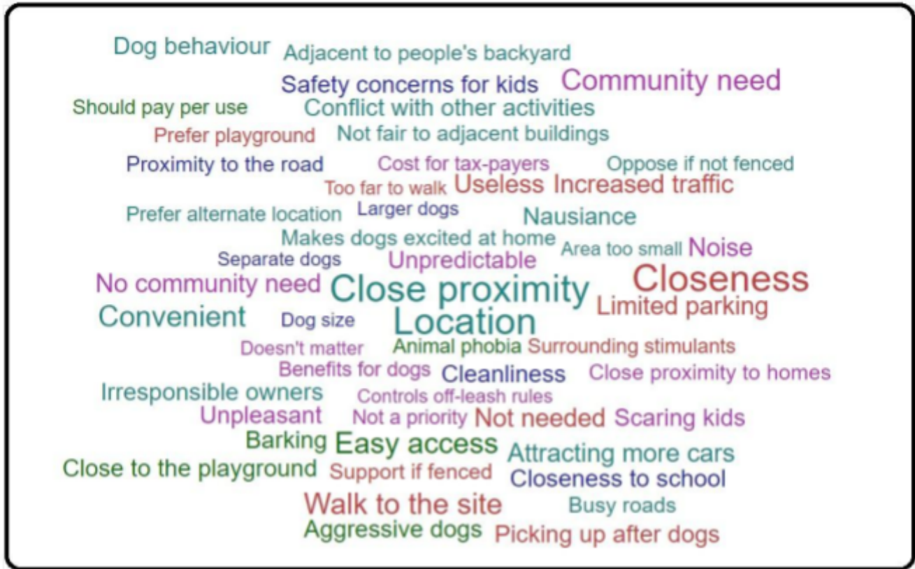
Weighted themes and codes for all the neighbourhoods - Reference Phase 1 survey (Open-ended question)