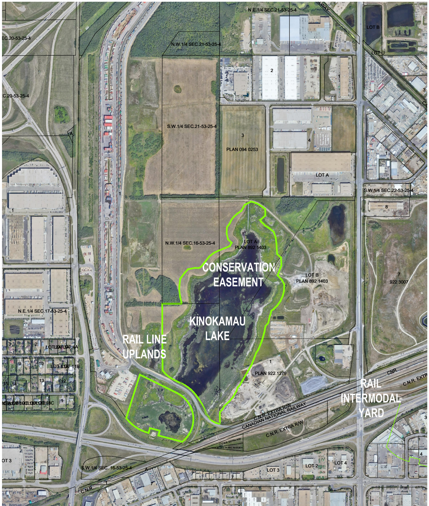
FIGURE 6 KINOKAMAU LAKE CONSERVATION AREA