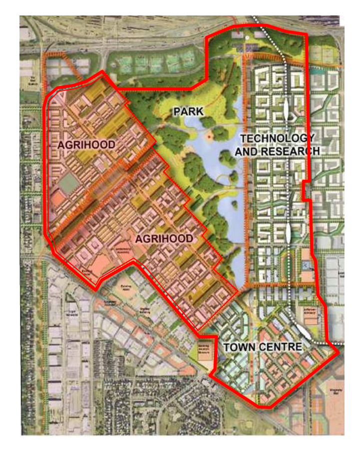
CENTRE CITY ARP